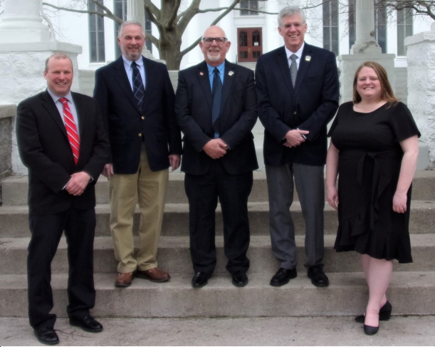
Newark Village Board